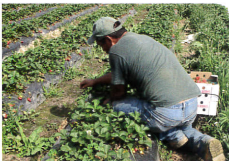
An agricultural worker in a field irrigated with recycled water.

Among the perceived risks is concern about the presence of trace concentrations of Pharmaceuticals and Personal Care Products (PPCPs) found in recycled water. But findings from a recent study indicate that, depending on the chemical and the exposure situation, it could take anywhere from a few years to many millions of years of exposure to non-potable recycled water to reach the same exposure to PPCPs that we get in a single day through routine activities.