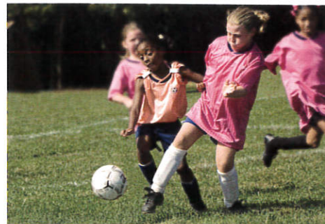
Many communities use recycled water to irrigate parks and playgrounds.

Through nature’s cycles, all water on Earth is recycled water. But, typically, when we hear the term “recycled water” it means wastewater that is sent from our home or business through a pipeline system to a treatment facility where it is treated to a level consistent with its intended use or disposal method. It is then routed directly to a recycled water system for uses such as irrigation or industrial cooling.